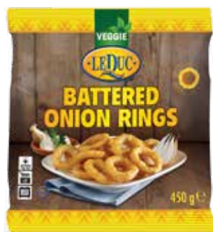
BATTERED ONION RINGS 12 x 450 gram