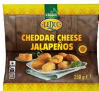
CHEDDAR CHEESE JALAPEÑOS 12 x 250 gram