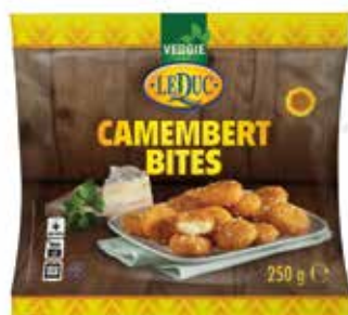
CAMEMBERT BITES 12 x 250 gram