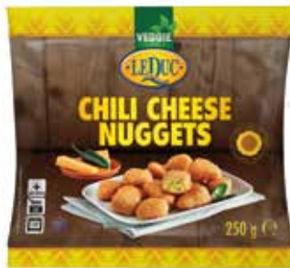
CHILI CHEESE NUGGETS 12 x 250 gram