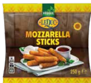
MOZZARELLA STICKS 12 x 250 gram