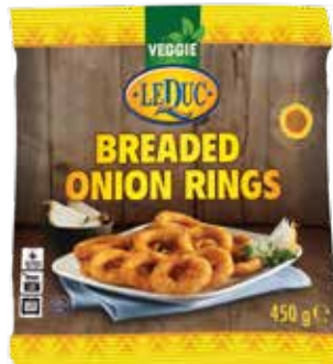
BREADED ONION RINGS 12 x 450 gram